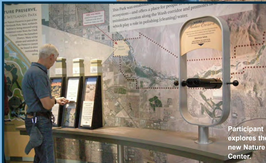
Participant explores the new Nature Center.